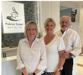
The Mantilia Team Realtors