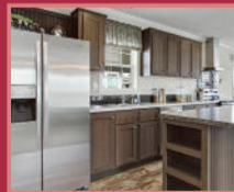
3 bedroom/2 bath